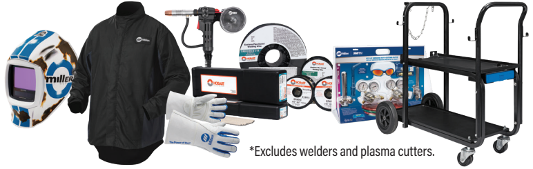
*Excludes welders and plasma cutters.

BUY $500 IN QUALIFYING PRODUCTS GET A $200 REBATE