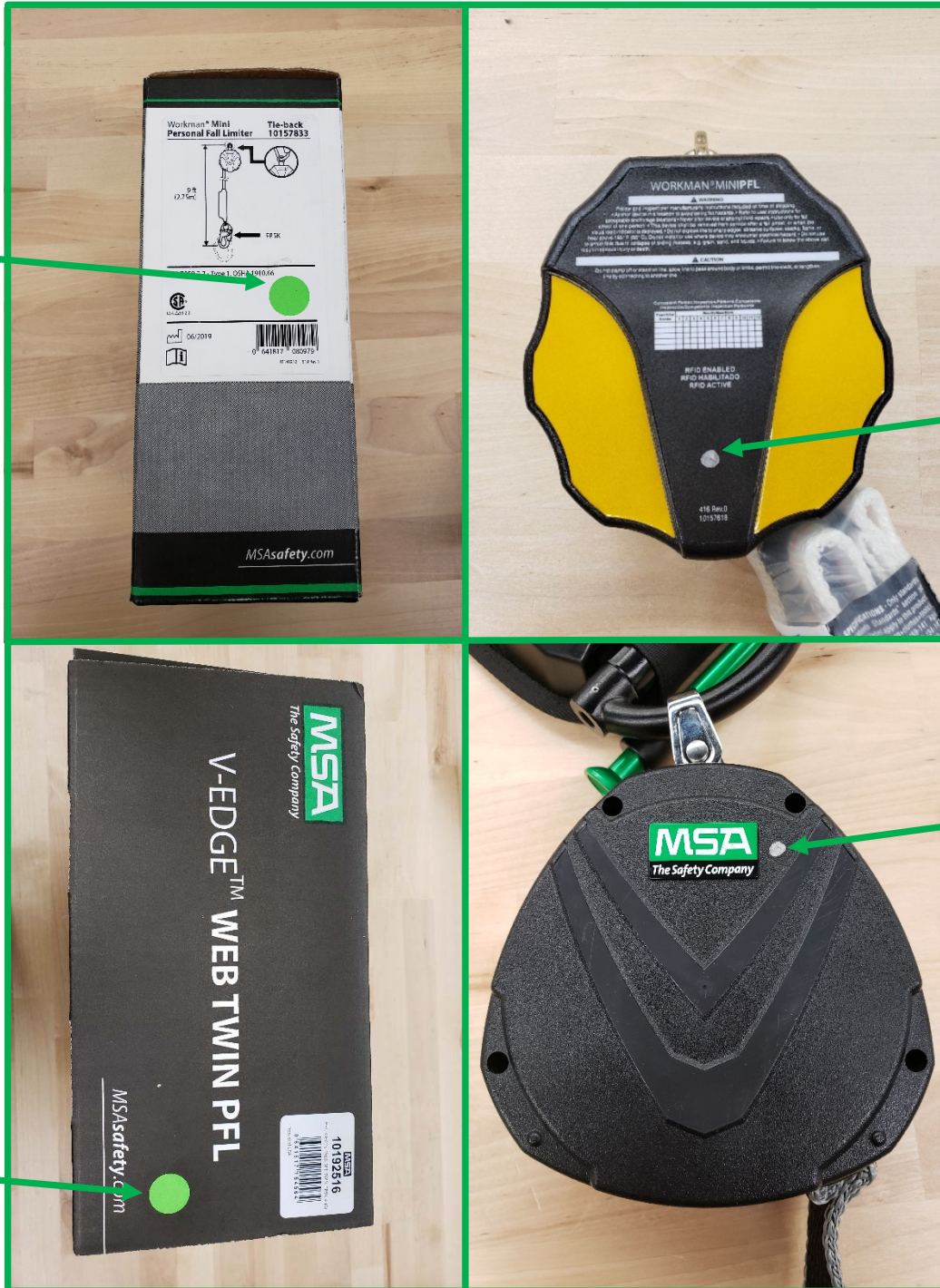
Figure 1 – Markings on MSA Inspected Product