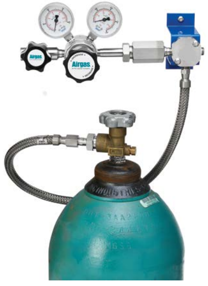
Wall-Mount Single Cylinder (regulator sold separately) Model Y158RMWS1FCVN2-AL