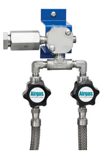
Wall-Mount Dual Cylinders Model Y158RMWS2FCV(CGA)-AL