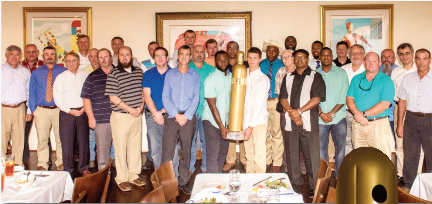
Hattiesburg Airgas employees celebrate the national award during a special recognition held at the plant on July 18.