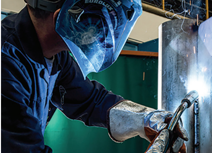
MIG welding of carbon steel

The high-performance welding gas solution for MIG welding of heavy structures