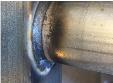
Good, sound weld