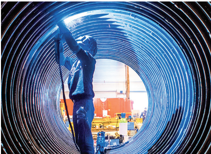
Suitable for heavy thickness